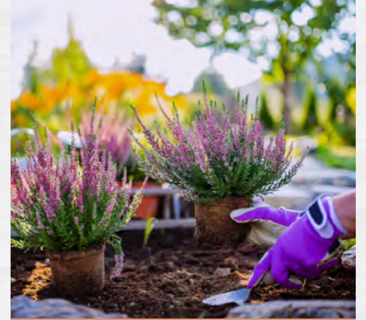
Plants & Garden