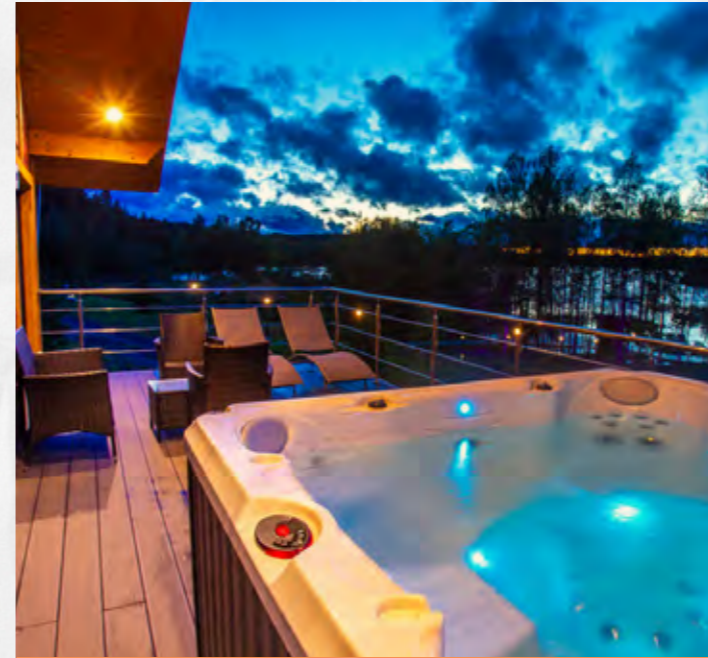
Spa & Jacuzzi